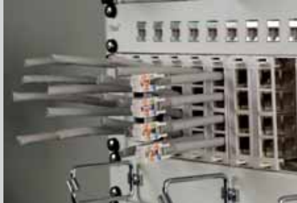
Connect wire guides