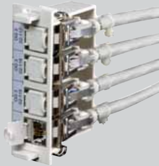
Shielded version RJ45/s