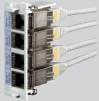
Coupling module with two-sided RJ45