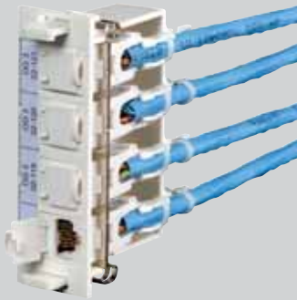
Unshielded version RJ45/u