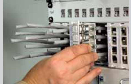
Click wire guides on jacks, snap in Keystone