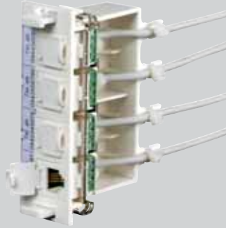
Telephone module RJ11